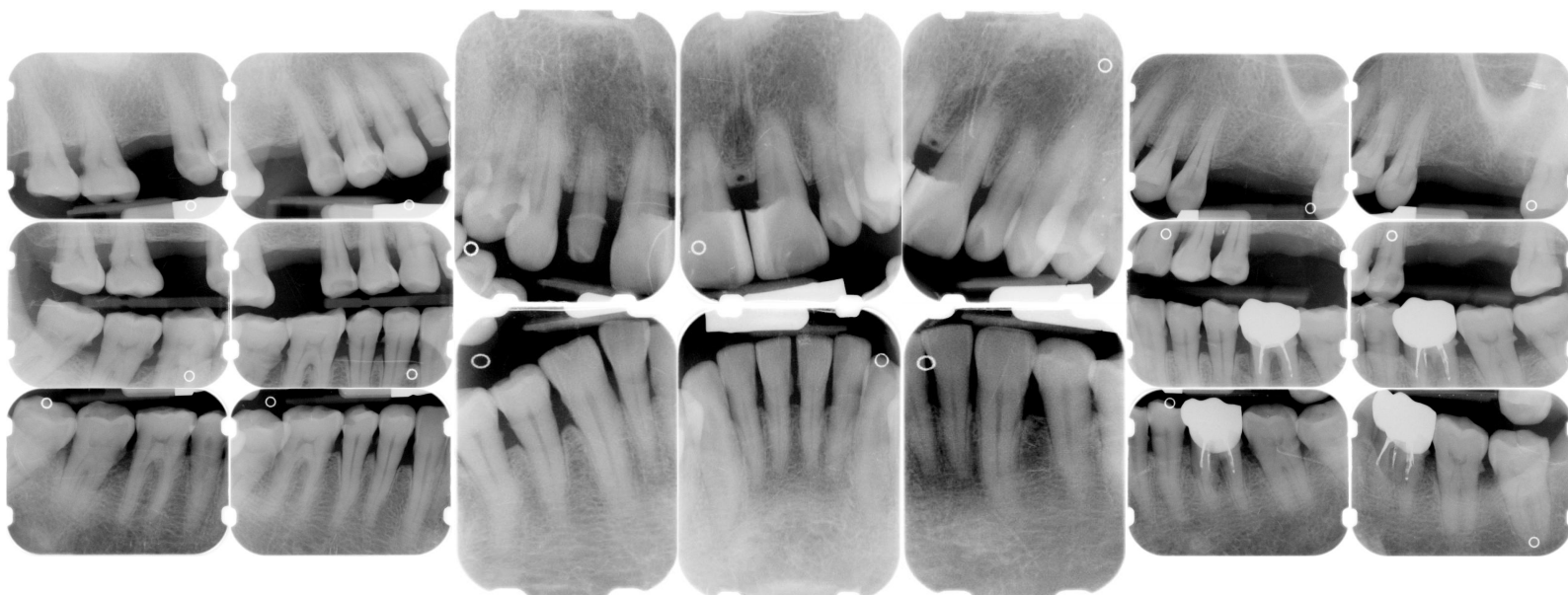
Intraoral pics before tx: